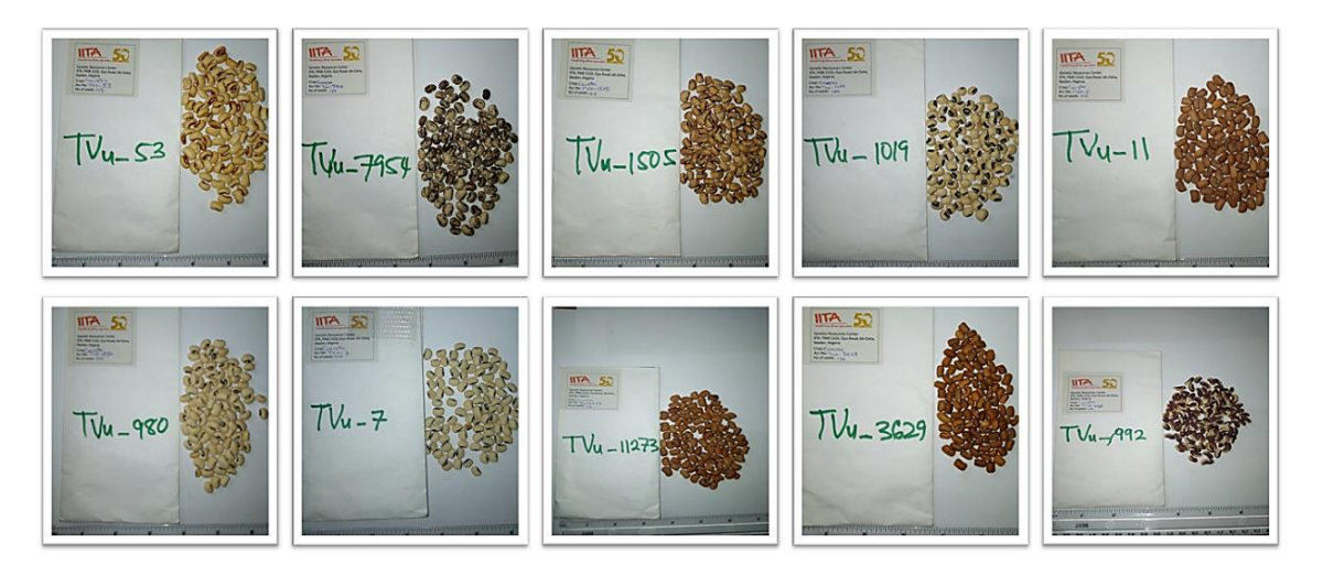
Figure 1. IPGRI cowpea accessions used in the study

Data were subjected to a two-way analysis of variance (ANOVA) using GenStat 16th edition (VSN International Limited, Rothamsted Experimental Station, Hemel Hempstead, UK) with Duncan's New Multiple Range test (DNMRT) ( \alpha = 0.05 ). Principal component analysis (PCA) and cluster analysis (Euclidean Distance) were done using Paleontological Statistics (PAST) software package (version 4.03) (Hammer, Harper, & Ryan, 2001). Cluster analysis reduces the number of discrete variable components by grouping them into a dendrogram based on a suitable coefficient of similarity (Tatineni, Cantrell, & Davis, 1996) and statistically congregates samples into clusters (Hair, Anderson, Tatham, & Black, 1995; Aremu, 2007). Genotypic (rg) and phenotypic (rp) correlation coefficients were computed using Plant Breeding Tools (PBTools, 2014):